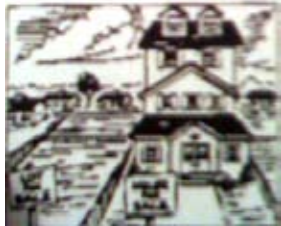
THE RELATIONSHIP between the cost of the lot and cost of the house is important.

ANSWER: Old rules of thumb have lost much of their meaning. It used to be that land