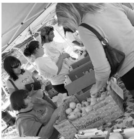
Locally Grown Fresh Fruits and Vegetables Bring Summer Tastes and Nutrition to Your Family Table