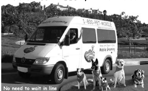
No need to wait in line.

• FURminator Reduces shedding by 60-80% when done every four to six weeks